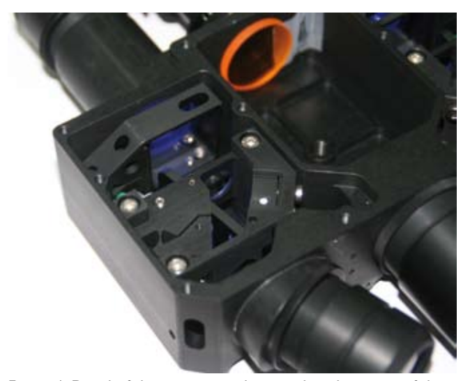
Figure 4. Detail of the prototype, showing the adjustment of the lenses using elastic hinges.

Figure 2 shows the concept design. Two projection units, on both sides of the central imaging unit, are used to project patterns on a circular surface of 20 mm diameter. Interference of the two patterns gives rise to so-called Moiré patterns. These patterns are recorded by a 0.45 million-pixel CCD camera and a software algorim converts the data into contour maps of the cornea; see Figure 3. The uncertainty associated with the data in this map is 25 \mu m in all three directions.