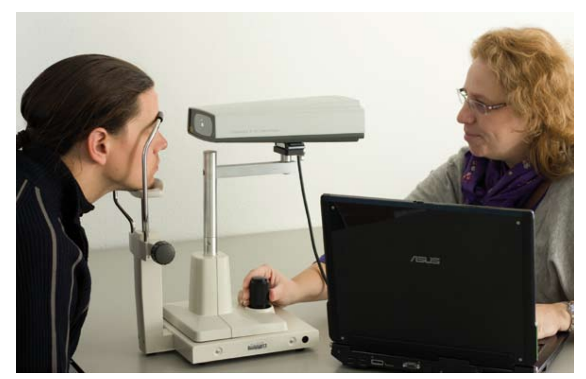
Figure 5. The final version of the instrument for use by clinicians and opticians.

After MECAL completed the product design, prototypes of the system were built by Nedinsco, based in Venlo, the Netherlands. Figure 4 presents a detailed view of the prototype as show in Figure 1. At the moment, these instruments are being used for clinical studies conducted by Polish medical researchers. Marketing of the commercial instrument, see Figure 5, will be done by Dutch start-up Meyeoptics.