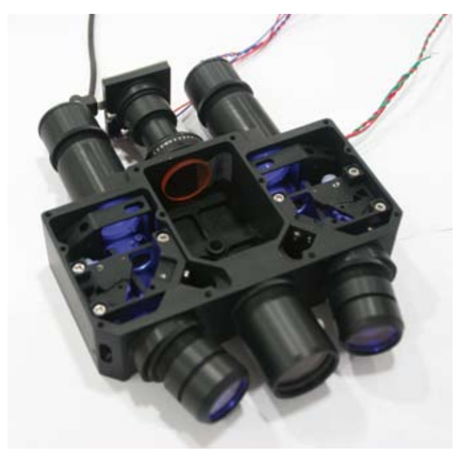
Figure 1. The Cornea Topographer.

Technological development leads to an ever-increasing availability of low-cost computing power and CCDenabled cameras. This broadens the industrial application scope of vision technology in the area of precision inspection and positioning. For example, fully- or semiautomatic 3D shape measurements of precision-engineered