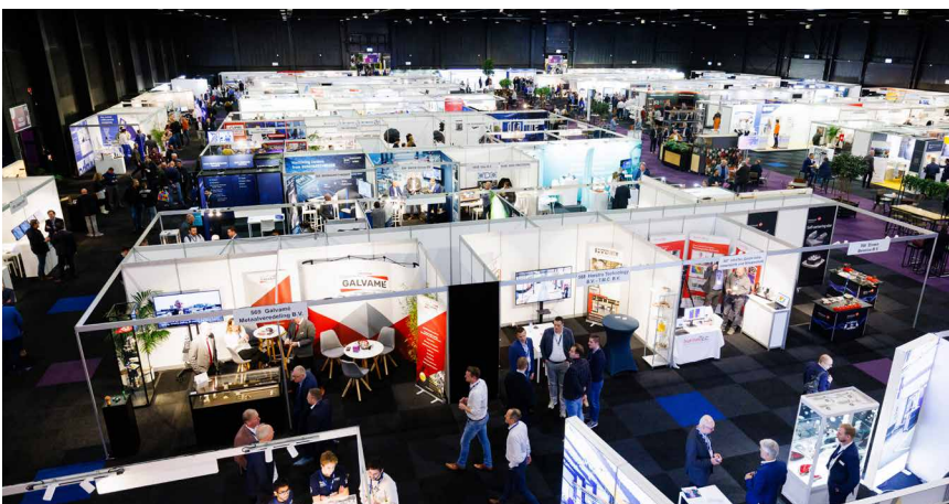
Impression of the Precision Fair 2023.

During the Precision Fair, visitors can meet representatives from industry, manufacturers, educational institutions, government agencies, technical universities, and science and incubator programmes. In the central Network Arena, the following parties can be found: Einstein Telescope, Big Science, euspen, VDMA, Sirris, NEN, EPIC Photonics, Digital Industry Boost (a partnership between Fontys, Summa College, Brainport Development and Mikrocentrum), DSPE, RVO, TU Delft, TU/e, FPT-Vimag, Project MARCH, AeroDelft, and Superbike Twente.